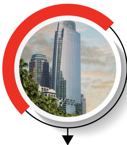
InterContinental Los Angeles Downtown