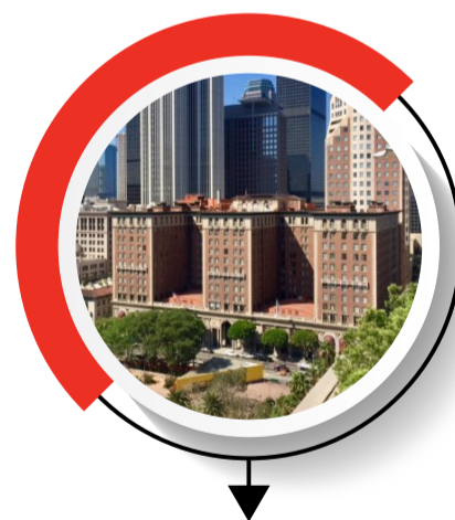
Millennium Biltmore Hotel