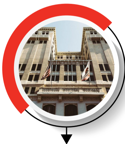
Los Angeles Athletic Club Hotel